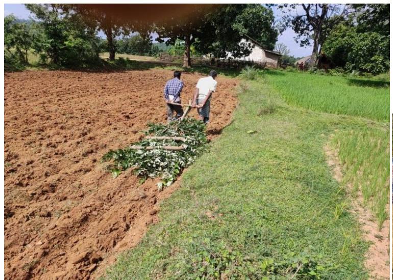
District, Muniguda of Rayagada District and Semiliguda of Koraput District by the 80 numbers of farmers around 290 acres of land. SMPB, Odisha provided technical