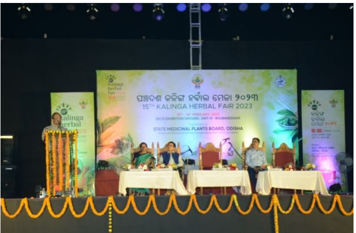
The 15<sup>th</sup> State Level Kalinga Herbal Fair was held from 10<sup>th</sup> to 16<sup>th</sup> February,2023 at IDCO Exhibition Ground, Bhubaneswar with 130 no. of

During the reported financial year three numbers of Regional Kalinga Herbal Fairs were successfully conducted at Rourkela, Muniguda and