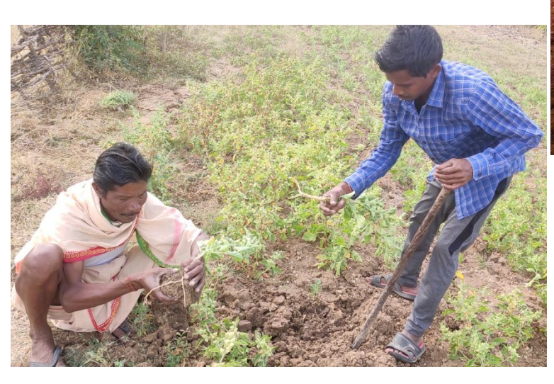
promotion of Tulshi cultivation was done in 7 Acres by

SMPB, Odisha had taken up the cultivation of Ashwagandha at Reamal of Deogarh District, Thakurmunda of Myurbhanj