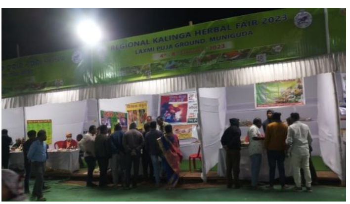
Regional Kalinga Herbal Fair:

During the reported financial year three numbers of Regional Kalinga Herbal Fairs were successfully conducted at Rourkela, Muniguda and