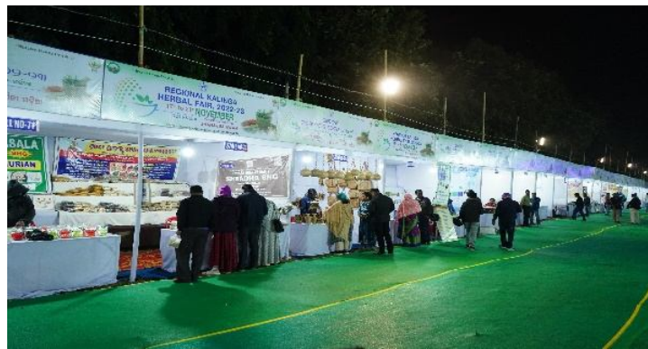
Berehampur by DFO, Rourkela, DFO, Raygada and DFO, Berehampur respectively.

State Medicinal Plants Board, Odisha was constituted to ensure sustainable availability and use of medicinal plants. The SMPB is implementing various schemes under financial support received from State sector and central sector. During the FY 2022-23 the following activities were conducted.