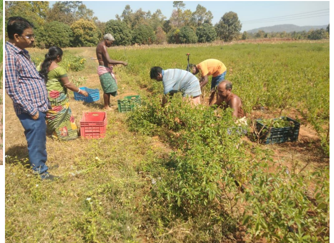
guidance and training to the farmers regarding seed sowing technique, organic manure and pesticide preparation technique and harvesting and storage technique to the farmers during the entire crop cycle of Ashwagandha. Similarly in the Uparjhar village of Bolangir district