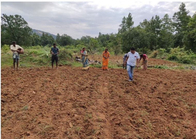
promotion of Tulshi cultivation was done in 7 Acres by