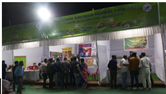
Regional Kalinga Herbal Fair:

State Medicinal Plants Board, Odisha was constituted to ensure sustainable availability and use of medicinal plants. The SMPB is implementing various schemes under financial support received from State sector and central sector. During the FY 2022-23 the following activities were conducted.