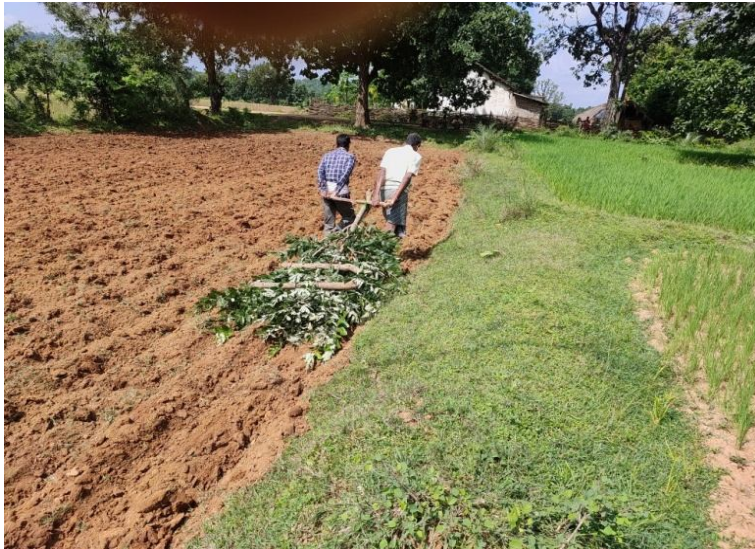
District, Muniguda of Rayagada District and Semiliguda of Koraput District by the 80 numbers of farmers around 290 acres of land. SMPB, Odisha provided technical